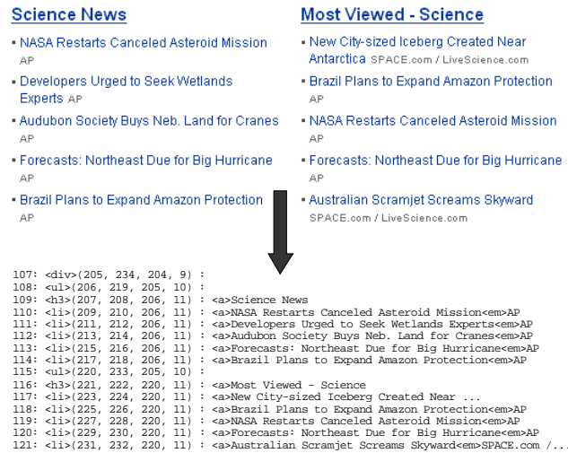
Fig. 2. An fragment HTML and its TSReC representation

TSReC can be easily built up by one-pass scanning of a Web page. Fig. 3 shows the algorithm for building it, which is modified from the conventional one for building tag trees. Basically the algorithm scans the Web page tag by tag (line 05, where text is also treat as a tag), and TSReC elements are created in lines 06-29 while computing the begin-end region code. According to the different types of tokens (open tag in lines 06-18, close tag in lines 26-29), different actions are taken. Note that a