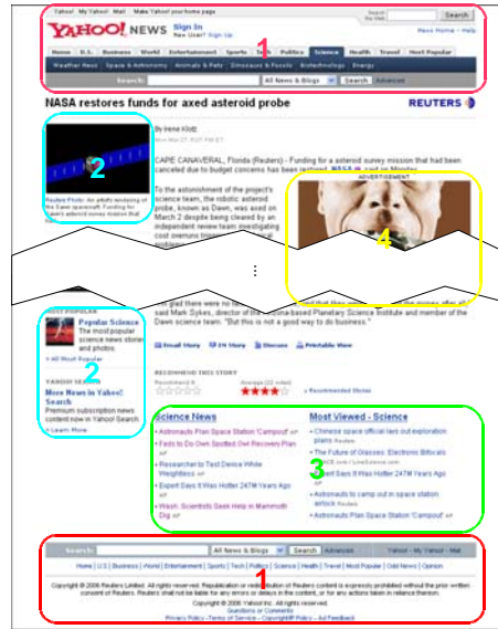
Fig. 1. Example Web news Page from Yahoo, with Navigation Area (Area 1), Events (Area 2), Relate Links (Area 3), and Advertisements (Area 4)

As an example, Fig. 1 shows a Web news page crawled from Yahoo News, in which we can see that, besides news content, there are other components like navigation areas, events, related links, and advertisements. The objective of Web news content extraction is to find out just the content , which is the main part of the Web page after removing the components mentioned above.